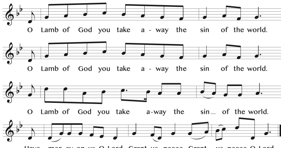
mer cy on us O Lord. Grant us peace. Grant us peace O Lord.