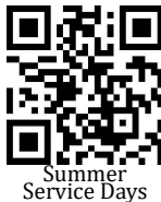
Summer Service Days

This summer, students going into grades 7, 8, and 9 are invited to participate in service projects within our church and community. The day will begin between 8 and 9 AM with a light breakfast, lunch will be served, and the day will end at 4 PM. Projects include making art for the pantry and freshening up the youth room, working in the community garden, reading or playing board games with the elderly, and more. We know families with children this age are often very busy in the summer. Participation is encouraged on whatever days and times fit your schedule. There is a sign up sheet at the Welcome Desk or you can register at: