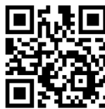
Open Door Mission

Open Door Mission's Lydia House is having to turn away women and families in need of housing, because even though they have the space for them, they don't have enough staff to provide quality care for them. They are in urgent need of full or part-time employees. Training is provided. If you would like to be the hands and feet of Christ in a powerful and practical way, use the link below to get more information or to volunteer. You can also use the link