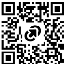
CJH Quilt Auction